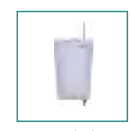
Standard: water tank assembly