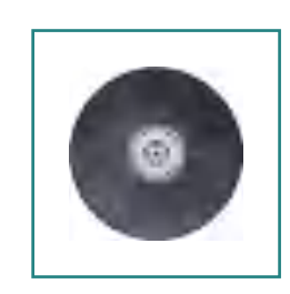
Standard: 19" pad holder